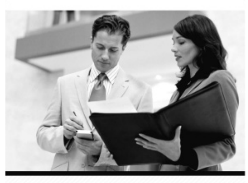
Proud Supporters of The Philadelphia Association of Paralegals

Permanent and Temporary Assorneys | Paralegals | Contract Specialists